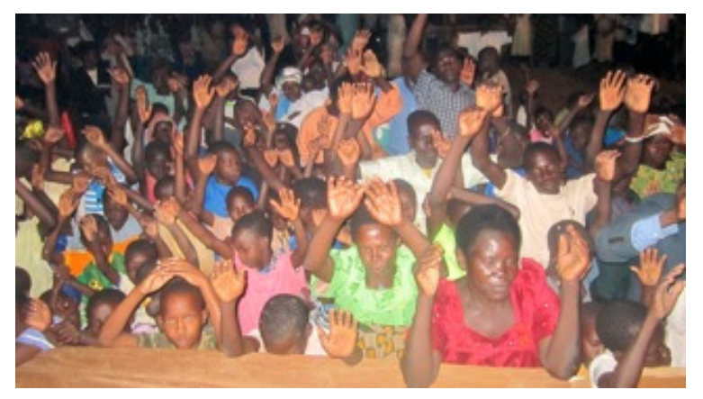
New souls in Christ- Mbuyendi

People were so eager for the evangelist training that we gave.