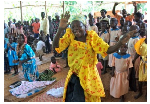
Joy at Kaiti!

Kaiti was first. Following our visit in 2010 we had given some land and financed the building of a church. As we arrived the whole of the church rushed out to greet us cheering and whooping in the way only Africans can! Many pastors were there testifying of their new found unity and of their on-going joint evangelistic work. A former drunk who had come to the Lord early on in