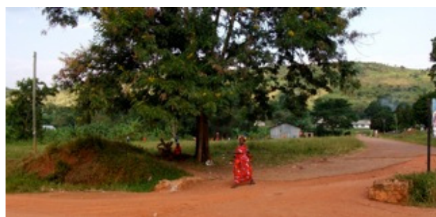
Crusade field (near hospital entrance)