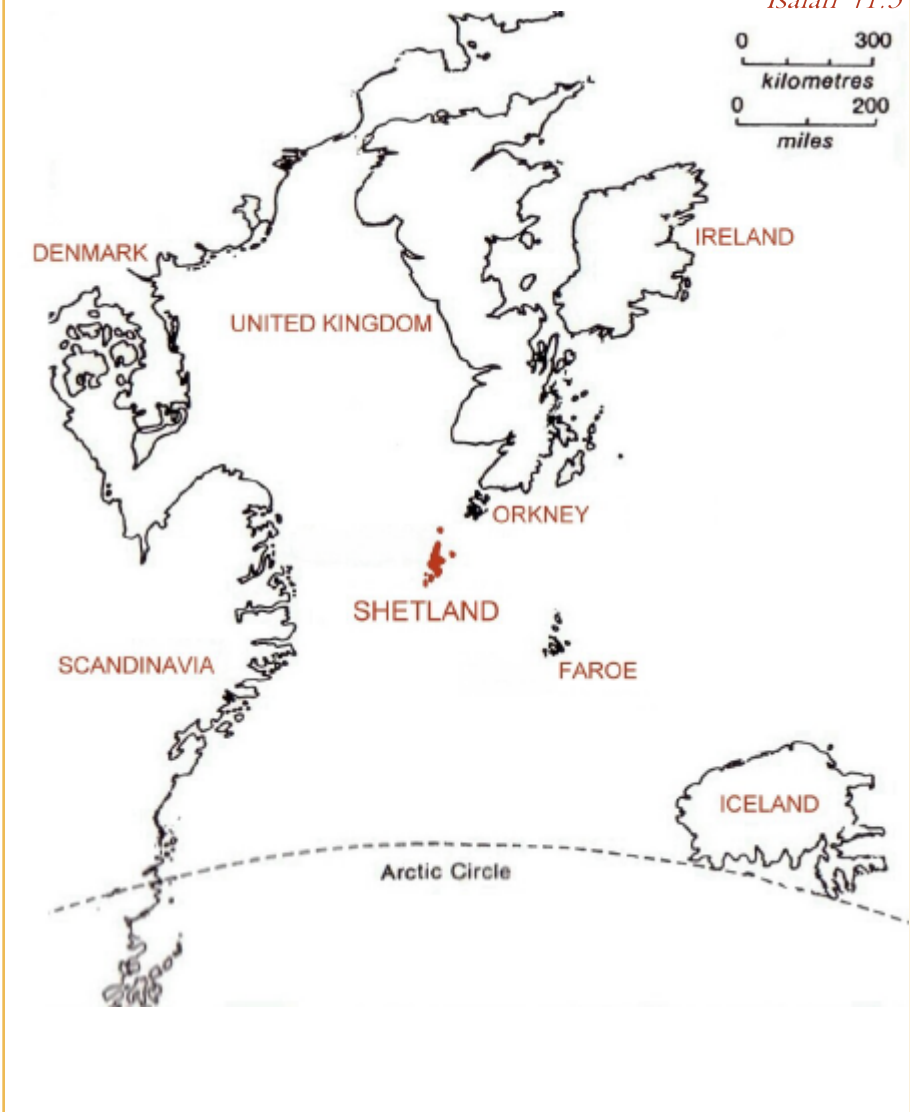
Shetland: a bridge and a stepping stone from the North Atlantic to the rest of Europe

Uniting the northern nations in seeking God's face for Europe